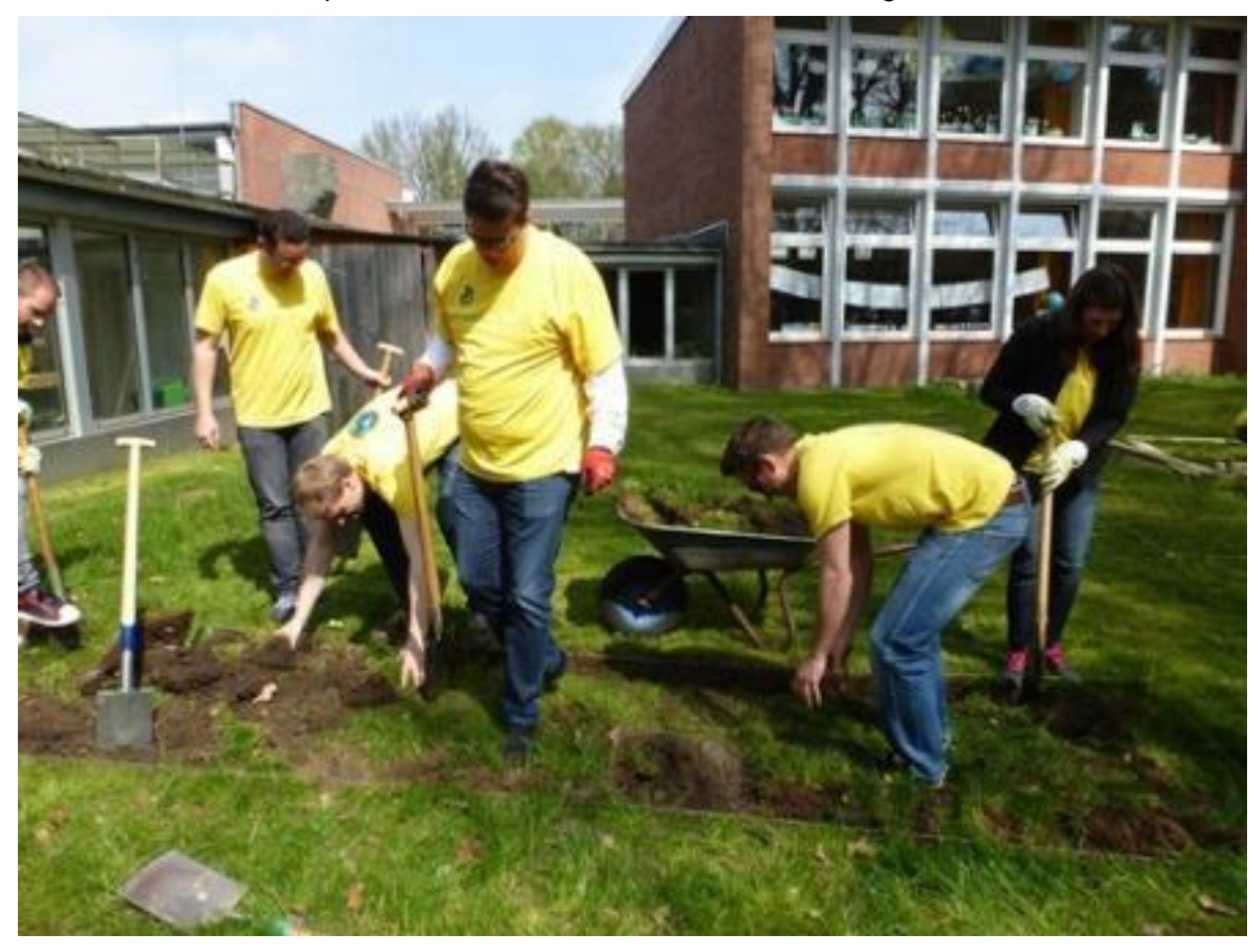
Team of General Mills Hamburg at work - Earth Day 2015, Brüder Grimm School Steinadlerweg

Thanks to the generous donation of UWW/General Mills Foundation the garden team of Billenetz was able to provide five gardens for eight groups of children. From April till October 2015 we have planted and cultivated patches of garden in four elementary schools for five gardening groups, where these gardens were already in existence from our prior activities. Additionally, we have created a new garden for three groups at Brüder Grimm School Steinadlerweg, thanks to the enthusiastic volunteer-help from the team of General Mills in Hamburg.