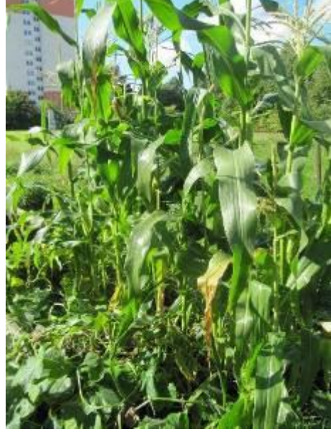
Patch at Rebus, spring 2015