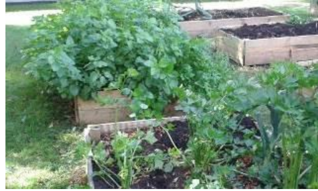
... and some weeks later