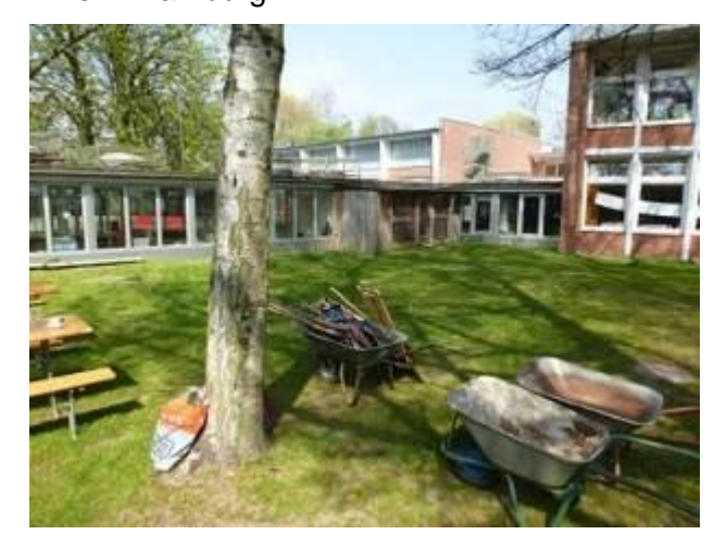
Gardening area before the building of patches

In the frame of the annual "Earth Day" on April 24th 4 huge patches and 6 regular ones (equivalent to 21 regular patches) should have been built with the assistance of ca.15 volunteers of General Mills in Hamburg.